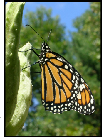
Monarch on milkweed pod

Marilyn's show at Huntley Meadows is on display through October and features a passion of hers: the world of the monarch butterfly.